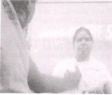
Ist Party न्यासकर्ता

Reg. No. 12354 Reg. Year 2010-2011 Book No. 4